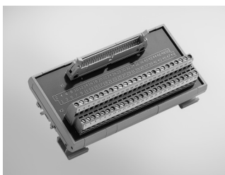
ADAM-3950 50-pin DIN-rail Flat Cable Wiring Board

PCI-1713U, PCI-1715U, PCI-1718HDU, PCI-1720U, PCI-1730U, PCI-1733, PCI-1734, PCI-1750, PCI-1760U, PCI-1761