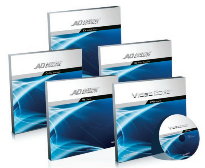
Vx Player is grouped with Vx Client.