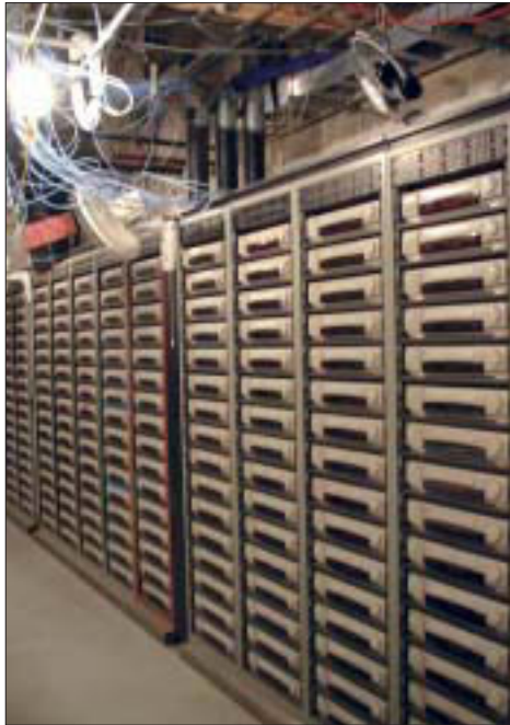
Racks of obsolete VCRs prior to their removal in favor of digital recorders. Once their signals were routed to the new DVRs, they were on their way to the scrap heap.

In the case of selecting a digital recording vendor, more than 30 different digital video platforms were examined during a two-year evaluation and planning stage, with the decision ultimately coming down to product features, quality and support. "A conversion of this size had never been done