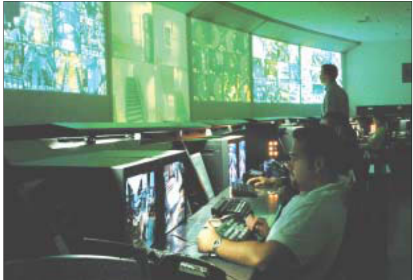
A virtual control room approach was used for the new Foxwoods monitoring room in which a number of images are projected onto screens for viewing by all the surveillance operators. The size, configuration, and number of images projected can be changed on the fly to respond to any operational situations.

To convert Foxwoods from analog to digital, it was necessary to run both sys-