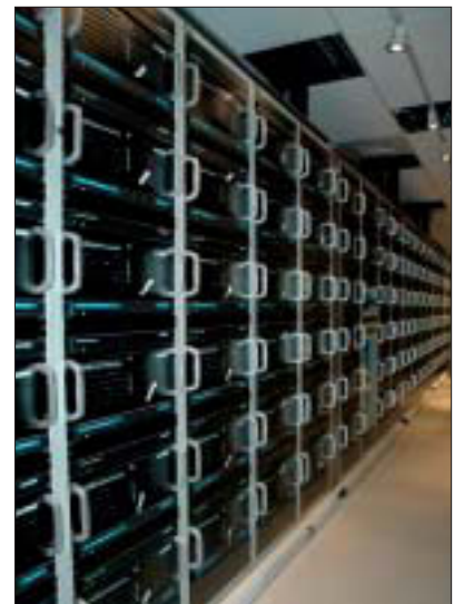
A portion of the Foxwoods upgrade’s newly installed DVRs shortly before they were configured and programmed in DVR Room 2. Manufacturer American Dynamics and independent consultant R. Grossman & Associates collaborated to customize features according to the client’s needs.

The original design called for liquid crystal display (LCD) monitors, but