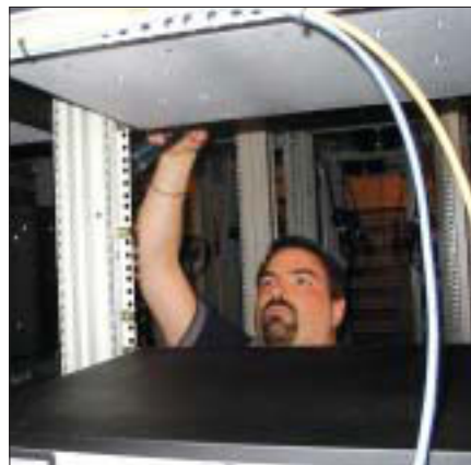
An installer prepares a rack to accept one of the Foxwoods project's 120 new American Dynamics DVRs, and later slides it into place. The units are kept in a room maintained at 68° F to avoid any thermal-related failures.

To ensure this support, a team was assembled that would ultimately include the manufacturers rep organization, manufacturer, integrator and an independent consultant ( see sidebar on page 46 ). During the course of 40 months, this group would plan and execute the largest digital video upgrade ever accomplished.