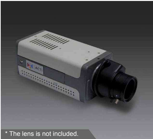
* The lens is not included.