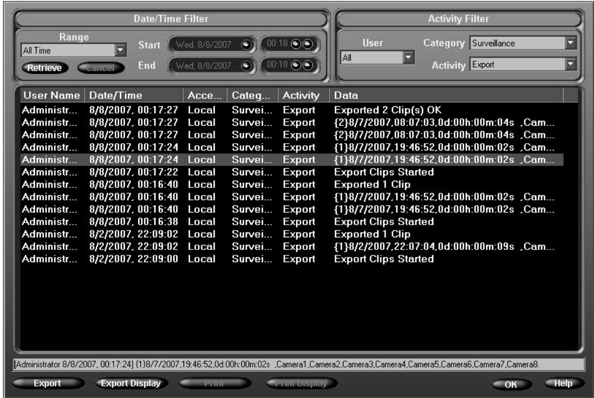
Figure 1: Multiple Entries for a single Video Export